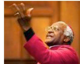
Desmond Tutu (video 3 min 29 sec)

The aim of the Symposium is not merely to learn more about the world, but to grapple and come to grips with the very assumptions that underlie the way we ourselves see the world and our place in it, and with what each of us can do - both individually and cooperatively - to move the world in this new direction.