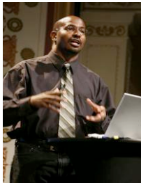
Van Jones (video 2 min 39 sec)