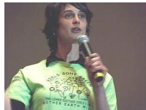
Julia Butterfly Hill (video 5 min 11 sec)