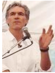
Brian Swimme (video 6 min 6 sec)