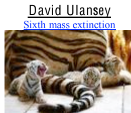
David Ulansey Sixth mass extinction